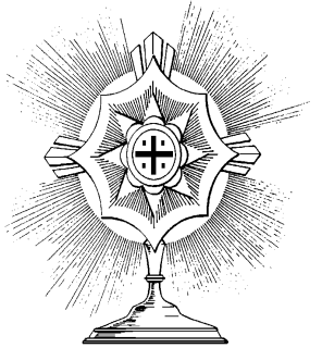
Adoration Chapel Open 24 hours a day, 7 days a week.

Matrimony You must contact the parish at least six months in advance to the desired date. Please complete a Wedding Registration form to schedule a wedding. It is a good idea to confirm the date with the parish first before reserving a reception hall as that date may not be available. For more information, please visit the parish website.